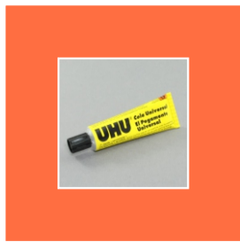
UHU ALL PURPOSE